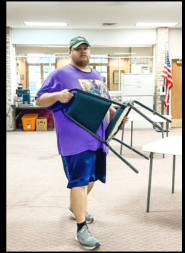
Jon Wabash Senior Center